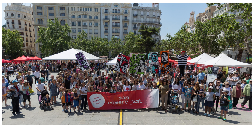
© Celebration World Fair Trade Day, city of Valencia 2018/ Coordinadora Valenciana de ONGD.

Fair Trade represents just 0,1% of trade in the world, which means that 99% is inequitable trade. Even being a small movement within the trade system, Fair Trade has much information to report about a structure that perpetuates poverty. More than 600 reports, in-depth interviews and awareness-raising campaigns are the results of CECJ's advocacy struggle. SDG's, poverty reduction, along with sustainable production and consumption are some of the mainstream fields.